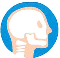
HEAD & NECK PAIN